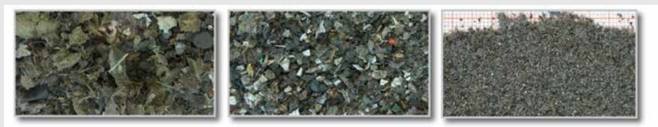
Secondary fuel samples

hand, is an important parameter for processing the combustion gas desulphurisation. Whereas coal has a rather high sulphur content of up to 5%, it is only around 0.02% for secondary fuels such as wood or biomass. With ELTRA elemental analyzers samples of greatly varying sulphur content can be examined precisely and reliably.