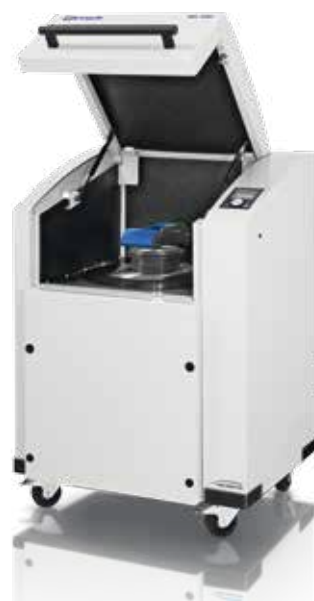
RETSCH Vibratory Disc Mill RS 200

Now the part sample can be ground to sizes of 100 µm and smaller, either in a ball mill or in a vibratory disc mill such as RETSCH's RS 200. This mill is typically used for sample preparation to XRF analysis and delivers grind sizes down to 100 µm and smaller in as little as 30 to 40 seconds. The grinding results of the RS 200 are highly reproducible. The pulverised sample can now be analyzed by XRF or elemental analysis. Solid, high-quality pellets are an important precondition for reliable and meaningful XRF analysis. With the PP 40, RETSCH offers a pellet press which produces strong pellets with a smooth surface.