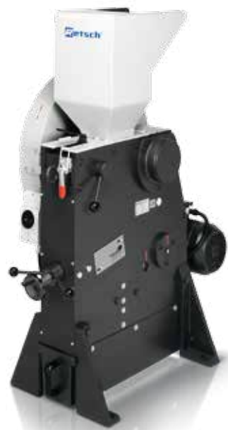
RETSCH Jaw Crusher BB 200

Elemental analyzers using combustion technology are ideally suited for the fast, accurate and reliable determination of carbon and sulphur in cement. Apart from size reduction, no further sample preparation is needed. ELTRA's elemental analyzers measure the concentrations of carbon and sulphur from ppm levels up to 100%.