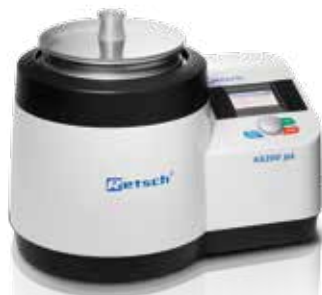
RETSCH Air Jet Sieving Machine AS 200 jet

RETSCH also provides a wide range of sieving equipment covering a size range from 10 µm to 125 mm, using a variety of sieving motions. With vibratory sieving, the sample is subjected to a 3-dimensional movement, i.e. a circular motion superimposes the vertical throwing motion. Due to this combined motion, the sample material is spread uniformly across the whole sieve area. For sieve cuts of powdered substances which tend to agglomerate, a 3-dimensional movement is not suitable. Therefore, RETSCH has developed the Air Jet Sieving Machine AS 200 to sieve agglomerating powders in a size range from 10 µm to 4 mm. The material on the sieve is moved by a rotating jet of air: A vacuum cleaner which is connected to the sieving machine generates a vacuum inside the sieving chamber and sucks in fresh air through a rotating slit nozzle. When passing the narrow slit of the nozzle the air stream is accelerated and blown against the sieve mesh, dispersing the particles. Above the mesh, the air jet is distributed over the complete sieve surface and is sucked in with low speed through the sieve mesh. Thus the finer particles are transported through the mesh openings into the vacuum cleaner or, optionally, into a cyclone. RETSCH also offers the software EasySieve ® for easy evaluation and documentation of the results.